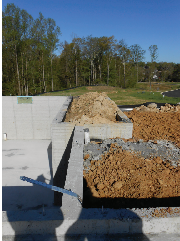
Concrete stem walls supporting more than 4 feet of backfill must have a slab bracing the base of the wall.

is supported by a footing and there is traditionally no slab, only bare earth covered by a vapor barrier required by Section R408.3. Alternatively, the vapor barrier is placed on the underside of the floor joists following Section R408.8 in some climate zones. No matter which section is used to protect framing from moisture, there is no slab requirement for a crawl space.