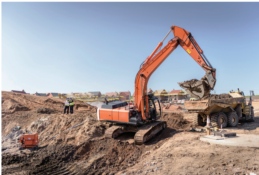
A soil test as required per California Health and Safety Code 17953.