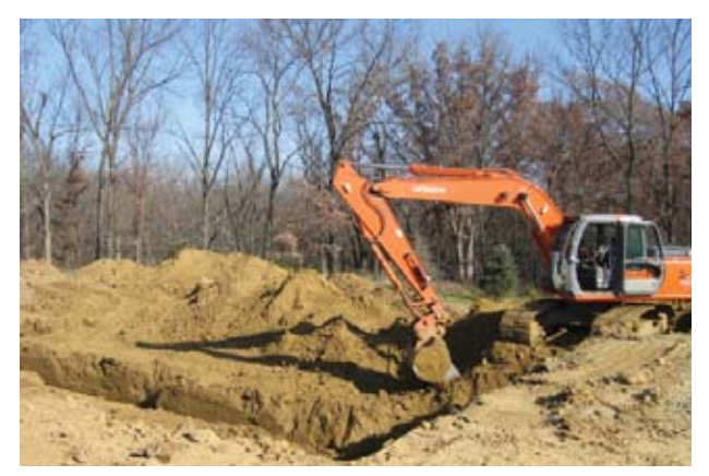
FIGURE 3-4 Excavation for foundation of a detached dwelling

ings must bear on undisturbed natural soil or compacted engineered fill (covered later in this chapter under "Fill"). The code also prescribes suitable base requirements for basement and garage floors, other slabs on grade and the base for crawl spaces. In all cases, the ground must be stripped of vegetation and organic material. The base for concrete floor slabs within the perimeter walls must be of suitable materials and compacted to prevent settlement. The thickness of compacted fill material below slabs is generally limited to 24 inches for clean sand or gravel and 8 inches for soil unless otherwise approved by the building official (Figure 3-4). [Ref. R403.1, R408.5, R506.2]