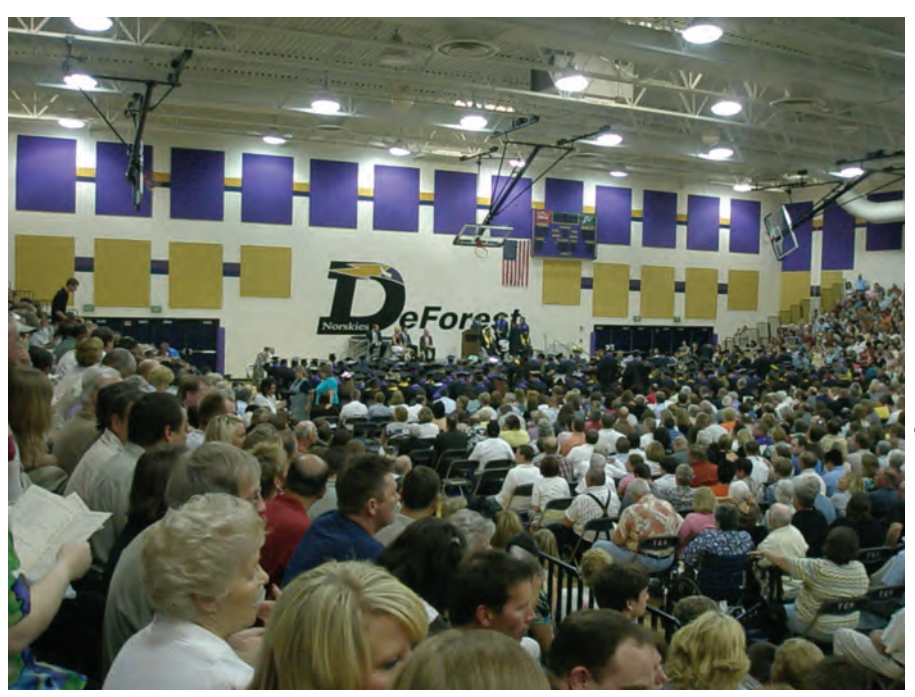
nternational Code Council®