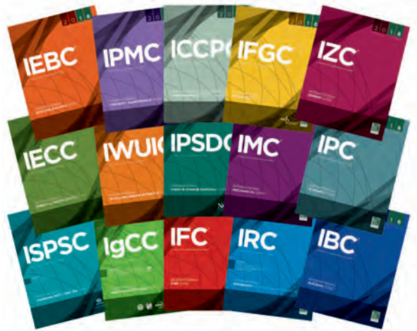
FIGURE 1-1 The 2018 International Codes.®

building officials and the building industry. The U.S. Department of Energy (DOE) provided the contract to create the 1983 MEC with content based on ASHRAE Standard 90-1980. The document was organized in the common code format and still exists in the structure and organization of the 2018 IECC.