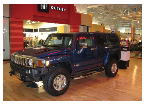
FIGURE 3-8 A vehicle display inside a covered mall building

Vehicle displays inside of buildings must be adequately safeguarded to limit the amount of fuel and ignition sources (see Figure 3-8). The IFC requires that such displays limit the amount of fuel to 5 gallons or one-quarter of the tank volume, whichever is smaller, and that the fuel tank fill opening is sealed and the batteries are disconnected. [Ref. 314.4]