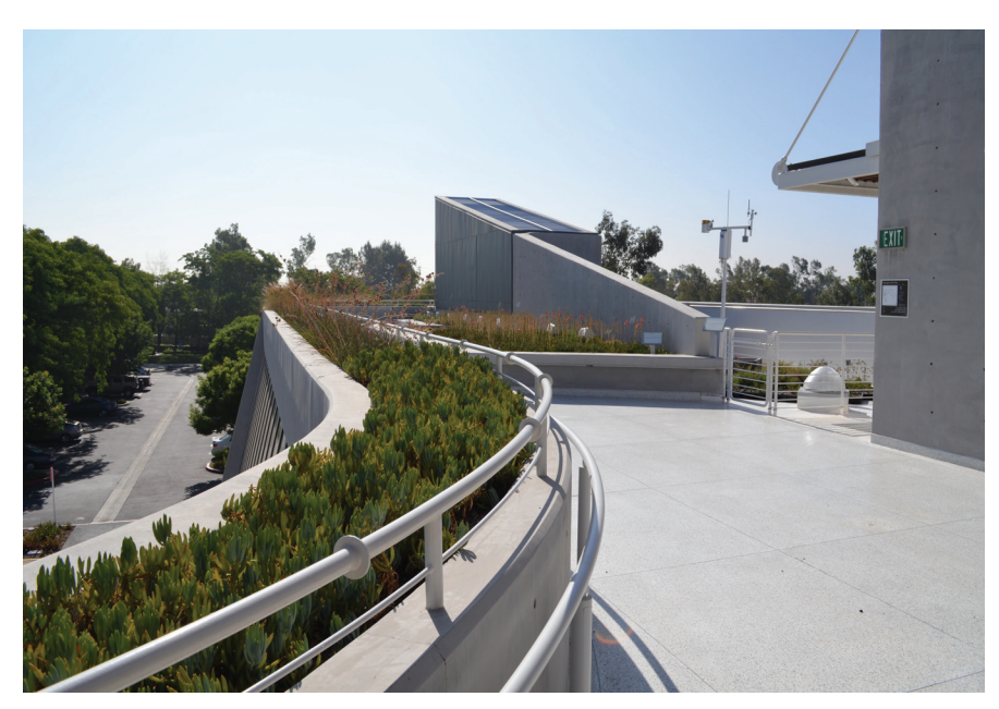
FIGURE 3-10 Landscaping on the roof must be maintained in a safe condition and allow fire-fighting access.

A landscape maintenance plan can be required that would include trimming of trees and shrubs, watering schedule and a list of vegetation species. The plan should provide for the removal of dead and decaying material at least twice a year. [Ref. 317.4]