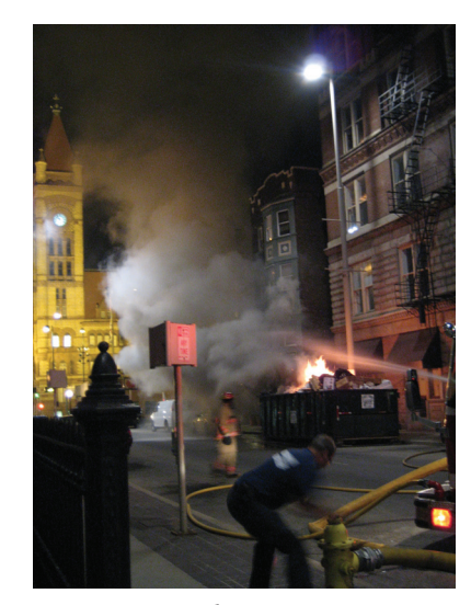
FIGURE 3-2 The IFC requires separation of outdoor dumpsters from buildings to limit the likelihood of the dumpster igniting an exposure building.