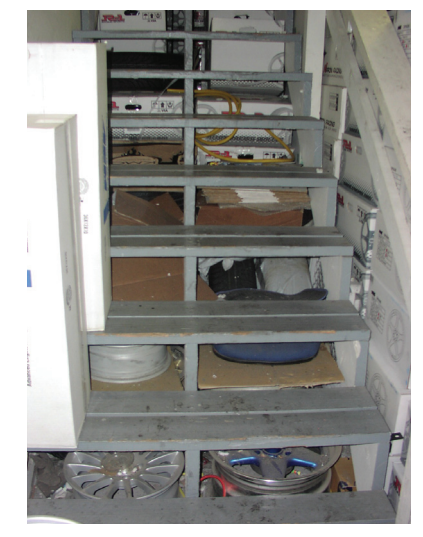
FIGURE 3-1 Storage of combustible materials beneath the egress stairs is a violation of the IFC. The concern is if the materials are ignited, this means of egress component is no longer available for the safe evacuation of the occupants.

When combustible materials become "waste," the IFC takes a more aggressive approach: the materials must be removed and disposed of in a controlled manner. For most combustible wastes, the IFC requires that they be placed in noncombustible waste containers or plastic containers formulated from chemicals that reduce the amount of heat it releases if ignited. When materials are placed in bulk trash receptacles (dumpsters), the fire code requires they be located at least 5 feet from combustible construction, wall openings and combustible roof eaves (see Figure 3-2). Because of land use limitations, it is very common to place dumpsters inside of buildings. In such instances, the room housing the dumpster is required to be protected by an automatic sprinkler system. Sprinkler protection is not required when the dumpster is located in a building constructed of noncombustible, fire-resistive materials. [Ref. 304.3]