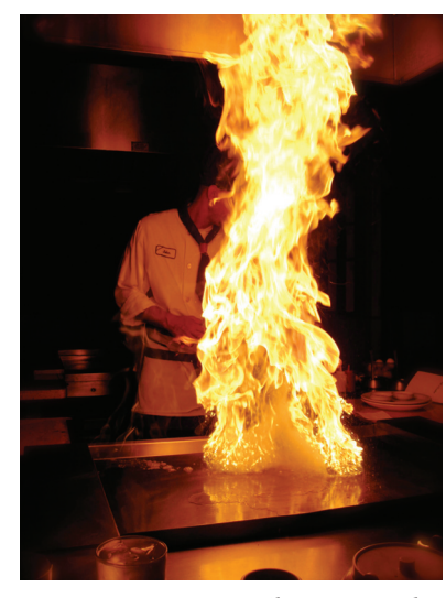
FIGURE 3-4 Open flames used to prepare food and beverages are regulated by the IFC.

systems or in hot, humid environments that can cause corrosion in electronic components installed in fire alarm control units and smoke detectors. In these cases, the fire code official can permit the system to