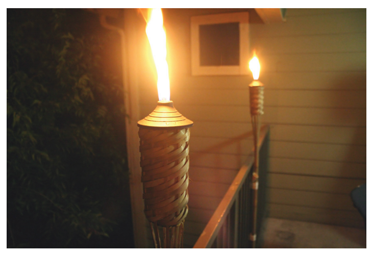
FIGURE 3-3 An open flame decorative device

Open flames are commonly used in the table side preparation of food and beverages. These activities commonly occur in assembly occupancies