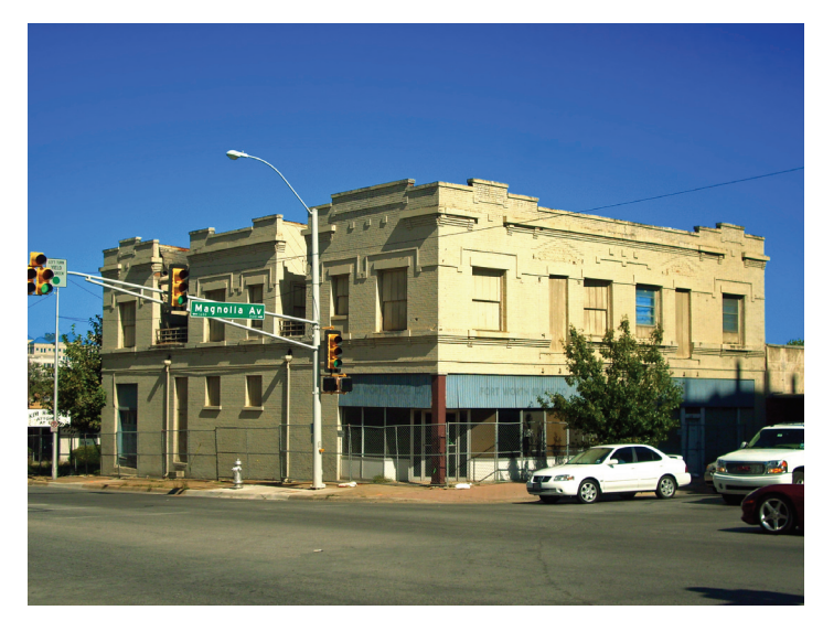
FIGURE 3-6 A safeguarded vacant building