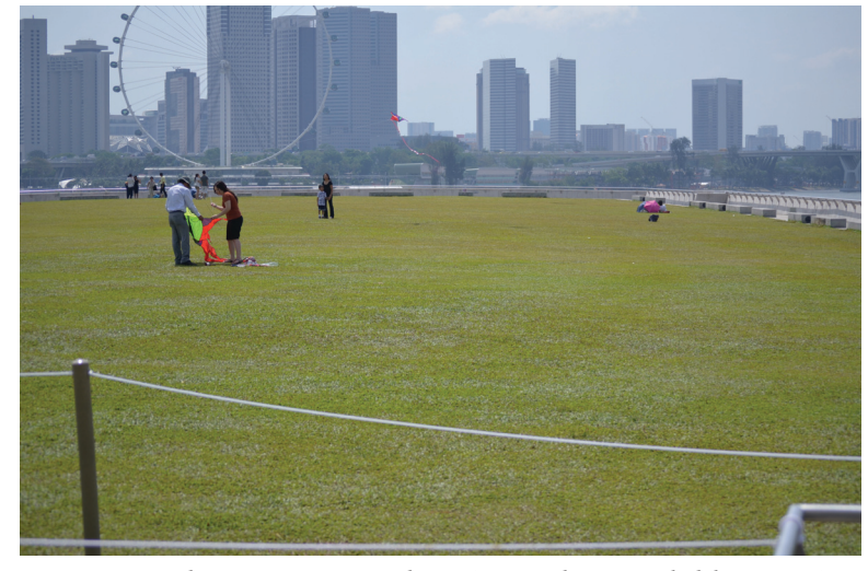
FIGURE 3-9 This grass-covered roof provides a park-like area for recreation.

IFC Chapter 3 stipulates the minimum precautions against fire. The requirements address ignition sources, open burning and recreational fires, open flames, powered industrial trucks and equipment, smoking, vacant premises, indoor displays and miscellaneous combustible materials storage.