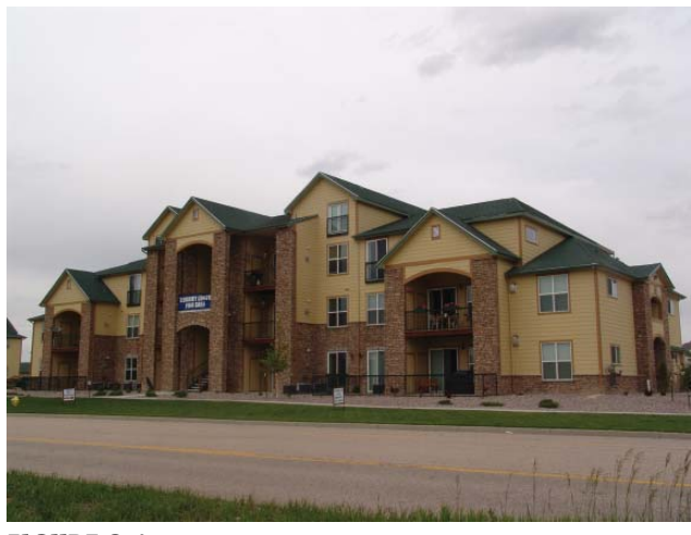
FIGURE 3-6 An apartment building is classified as a Group R-2 occupancy.

Buildings in which people live and sleep are designated as Group R occupancies. There are four subcategories of Group R occupancies, depending on the number of dwelling units in a building and whether or not people are familiar with their surroundings. Any time people are asleep in a building, their reaction time to an emergency is delayed. There are also inherent hazards when people are cooking or just living in a dwelling unit. This occupancy group also includes buildings that have one or two housing units and cannot be constructed under the International Residential Code (Figure 3-6). [Ref. 310]