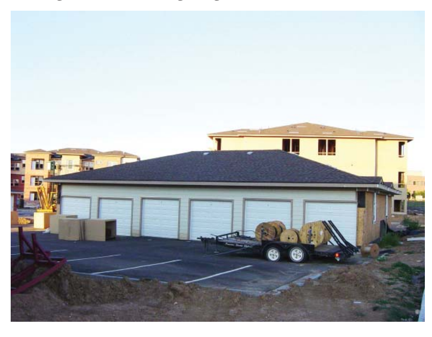
FIGURE 3-7 A private garage is classified as a Group U occupancy.

Group U occupancies include buildings or areas that are accessory in nature to a main occupancy. These buildings are generally low-hazard occupancies. They include miscellaneous structures such as fences and retaining walls. Group U occupancies include private garages, barns, sheds and agricultural buildings (Figure 3-7). [Ref. 312]