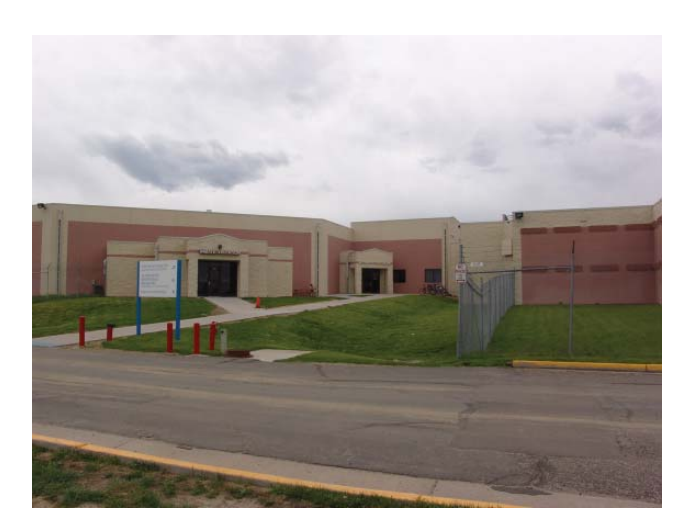
FIGURE 3-4 A county jail falls within the Group I-3 occupancy classification.

When a building contains reasonably large amounts of hazardous materials, it falls within the Group H occupancy classification. Hazardous materials are classified as either physical or health hazards. Physical hazard materials are materials that burn, have accelerated burning or produce an explosion. Health hazard materials can cause death or injury or can incapacitate a person after a single, brief exposure. These occupancies are obviously in the most hazardous group in the IBC. Some hazardous materials are permitted in other occupancy groups as long as they do not exceed a specific amount. However, when those amounts exceed a maximum allowable quantity of materials, the building receives the hazardous occupancy classification. There are five different levels of hazardous occupancies based on the level of hazard. This occupancy includes buildings where hazardous materials are stored, used or manufactured. [Ref. 307]