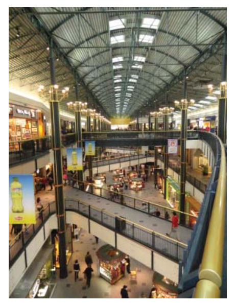
FIGURE 3-5 Retail stores in a mall are classified as Group M occupancies.