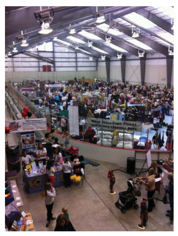
FIGURE 3-1 A community center is an example of an Assembly occupancy.